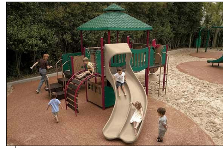
TOT COMPOSITE PLAY STRUCTURE