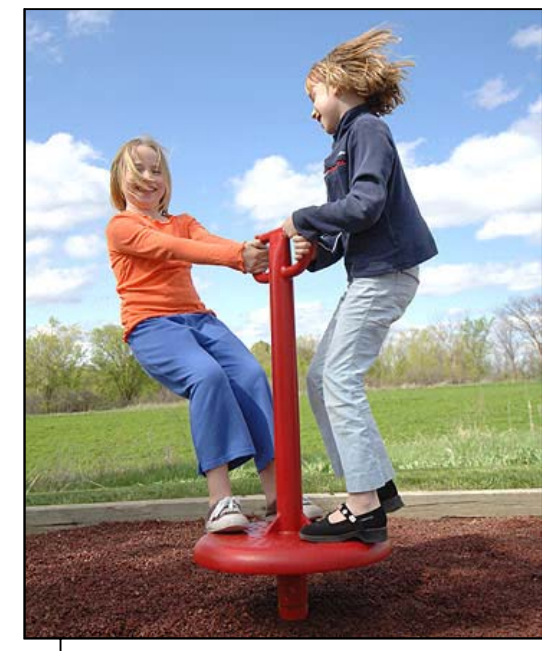
YOUTH INDEPENDANT STAND-UP SPINNER