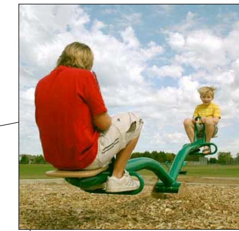
TOT SPRING SEESAW