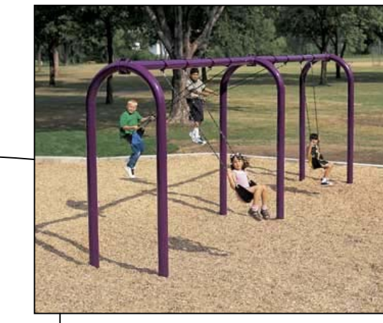
TOT ARCH BELT SWINGS